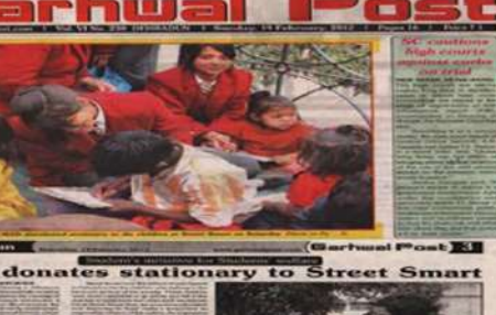
Group of children at the inauguration of the 'Street Smart' initiative.

The project is aimed at providing a safe and healthy environment for street children and to help them to lead a normal life. The project is being implemented in the form of a community centre where street children can come and play, study and receive medical attention. The project is being implemented in the form of a community centre where street children can come and play, study and receive medical attention.