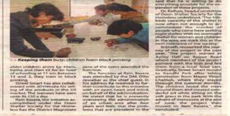
Group of children at the inauguration of the 'Street Smart' initiative.

Two NGOs have come together to not only help the underprivileged but also to ensure that they create their own standing in the society. The initiative is a joint effort of the Department of Social Welfare, Dehradun, and the District Child Protection Society, Dehradun. The project is aimed at providing a safe and healthy environment for street children and to help them to lead a normal life. The project is being implemented in the form of a community centre where street children can come and play, study and receive medical attention. The project is being implemented in the form of a community centre where street children can come and play, study and receive medical attention.