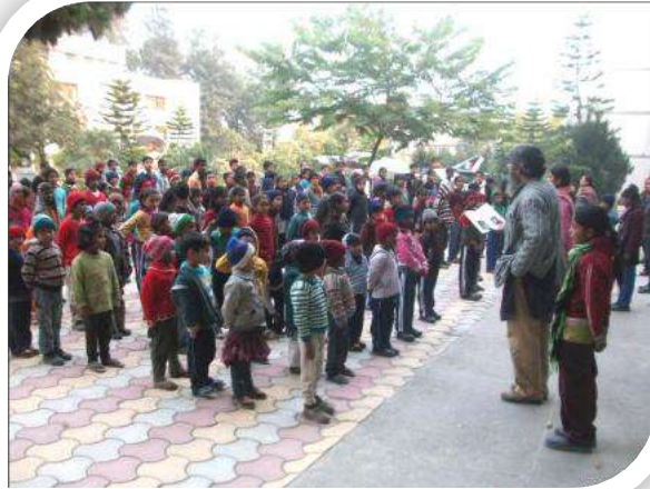
Assembly at Wings