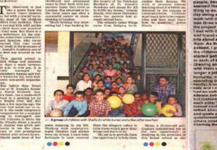
Group of children at the inauguration of the 'Street Smart' initiative.