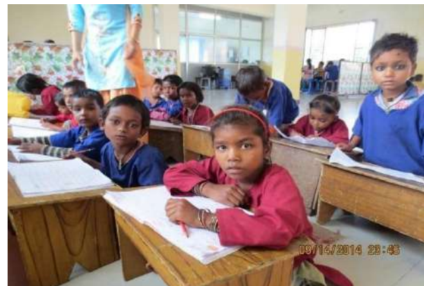
Street Smart Children