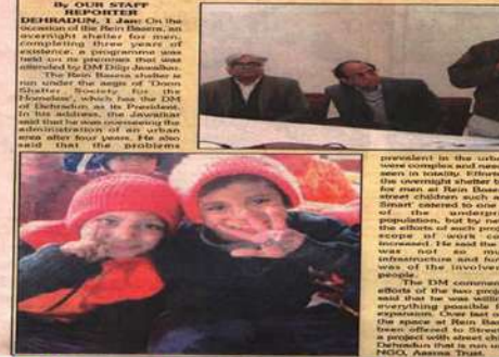
Group of children at the inauguration of the 'Street Smart' initiative.