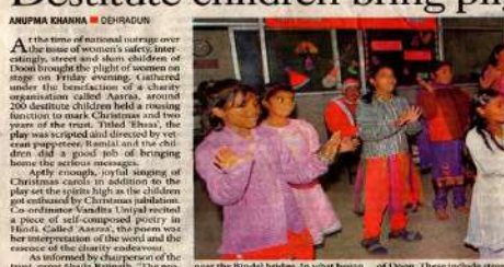
Group of children at the inauguration of the 'Street Smart' initiative.

The project is aimed at providing a safe and healthy environment for street children and to help them to lead a normal life. The project is being implemented in the form of a community centre where street children can come and play, study and receive medical attention. The project is being implemented in the form of a community centre where street children can come and play, study and receive medical attention.