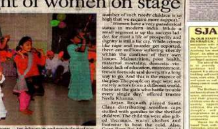
Group of children at the inauguration of the 'Street Smart' initiative.

The project is aimed at providing a safe and healthy environment for street children and to help them to lead a normal life. The project is being implemented in the form of a community centre where street children can come and play, study and receive medical attention. The project is being implemented in the form of a community centre where street children can come and play, study and receive medical attention.