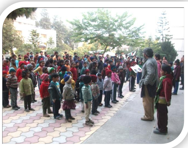
Assembly at Wings