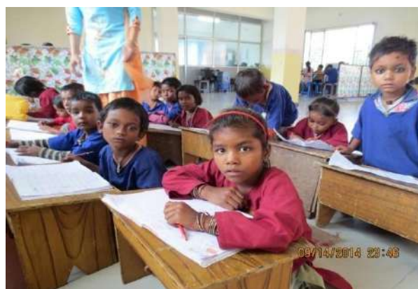
Street Smart Children