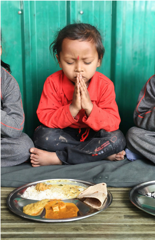
Nutrition: Food for Thought

Aasraa’s Centralized Kitchen prepares nourishing and hygienic food with a strong emphasis on food safety and balanced nutrition. The kitchen ensures that every meal is thoughtfully crafted to promote health and well-being of children.